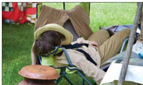
KEEPING HISTORY ALIVE CAN BE EXHAUSTING! ONE OF OUR COLONIAL VILLAGE RE-ENACTORS. (SEE PAGE 5.)

To bring together people interested in Sherman's history, to collect and preserve objects which help to establish or illustrate its history, to acquire and manage any property available to the Society, to interest young people in their town's heritage, to publish historical information, and to maintain a library of historical materials.