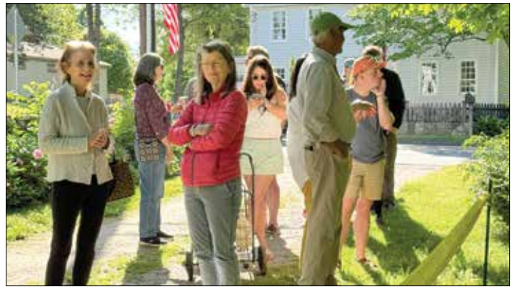
BARN SALE EARLY BIRDS!